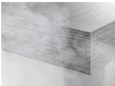
Super water resistant Edgebands