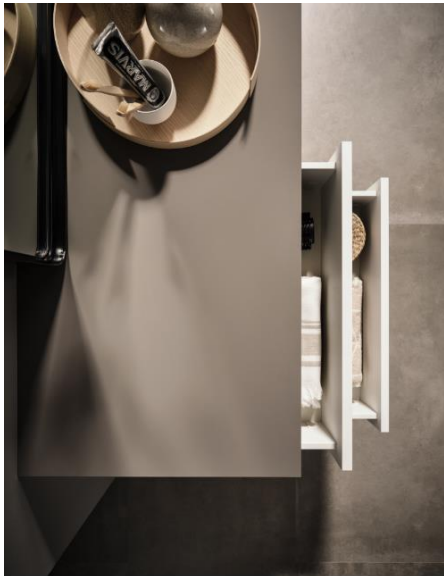
Collection noble matt